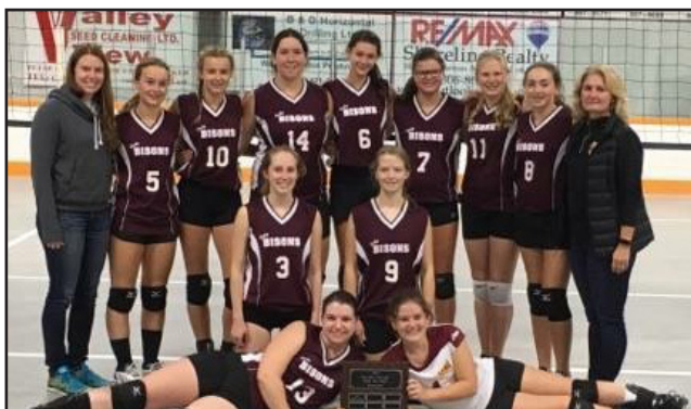
Lady Bisons Volleyball are happy after having won first place in the Rock the Block tournament, late September 2017

Boys volleyball practiced throughout the first month of school and will kick off their season come October.