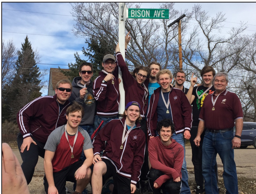
Last year's Bison Basketball team was amused to find themselves on Bison Ave in Elbow, SK