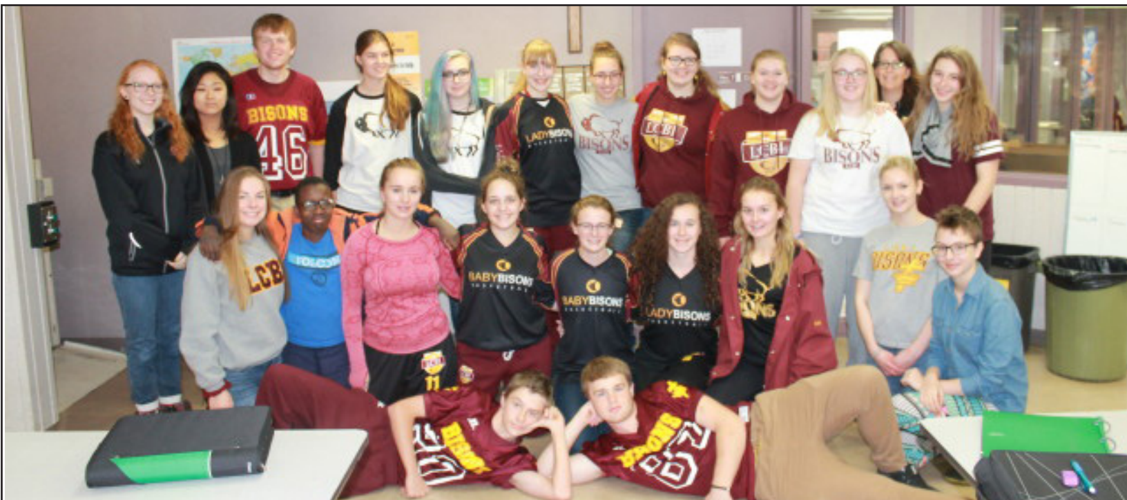
Above: The Student Leadership Council.