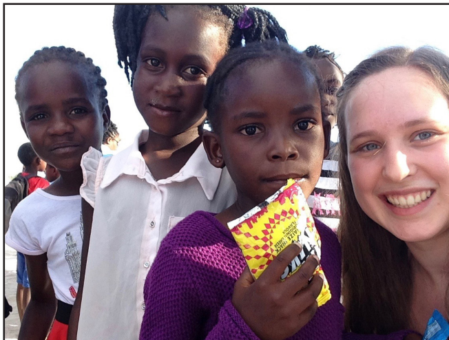
We spent an afternoon at a day care in Ondangwa playing with kids

One goal of the Pre-Assembly was to create a message to present to everyone at the Twelfth Assembly. The message was a way to outline important issues the world faces that the youth believe should be addressed. After much discussion, we narrowed it down to three main points: revival of churches, equity, and education. We presented the message at the Assembly, and we called upon the global communion of the LWF to take action in