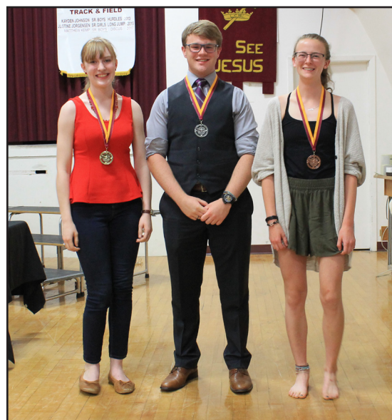
Above left: Lady Bison Basketball Awards winners