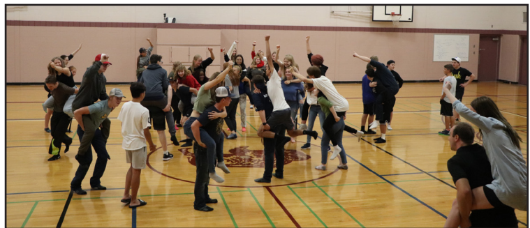
Above: Staff and students engaging in campus life lead activities during the evening after Opening Day.