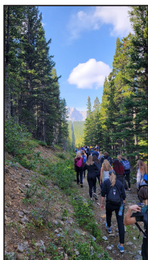
On the first weekend of the school year, 56 LCBI students, staff and parents headed out to Wilderness Ranch Camp in Alberta for our Annual Alpine Trip.