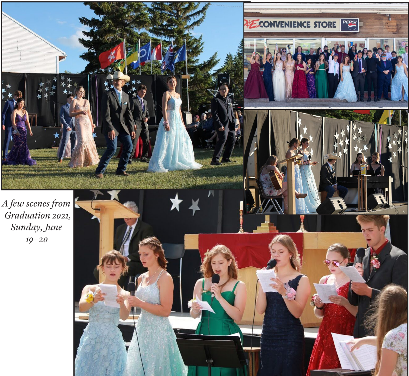
A few scenes from Graduation 2021, Sunday, June 19-20

Want to read more about the Rude girls' LCBI experience? Check out their profile in the June 25 issue of The Outlook: https://bit.ly/3rwo7p