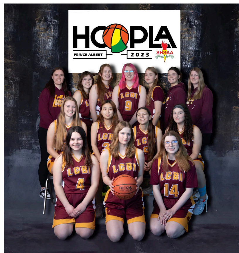
In March of 2023, our Senior Girls Basketball team competed at HOOPLA for the first time since 2008.