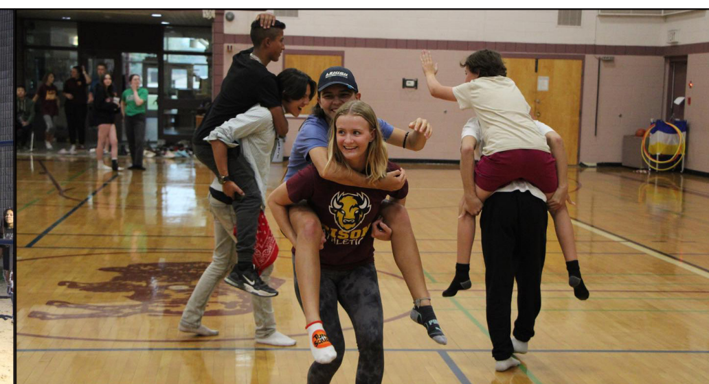
Orientation week activities continued with carrying fellow students on our backs