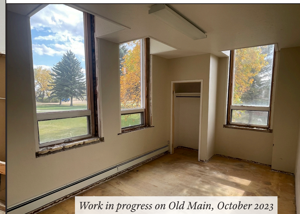
Work in progress on Old Main, October 2023