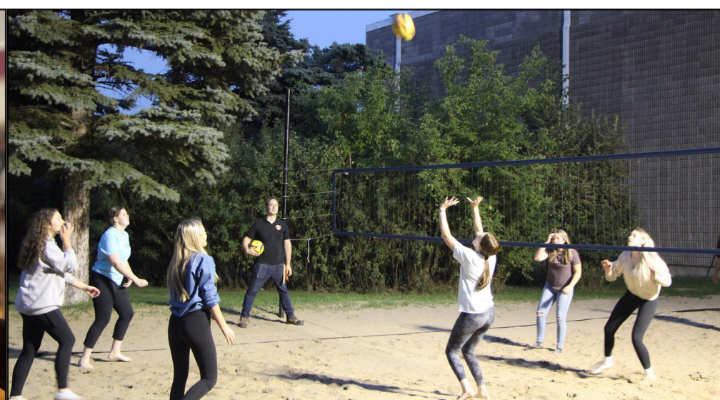
Beach volleyball at the beginning of the 2023–24 school year. The weather was perfect!