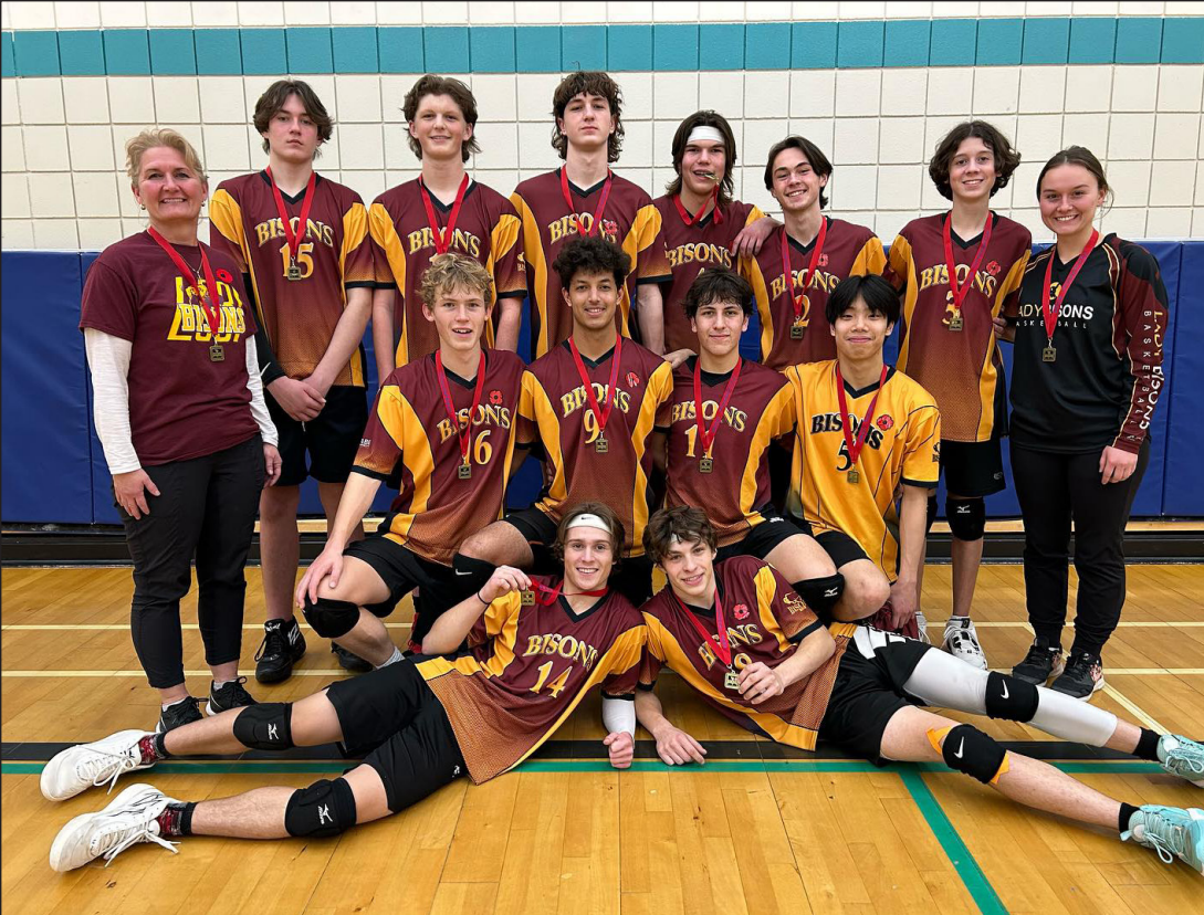
Boys Volleyball conference champions, November 12