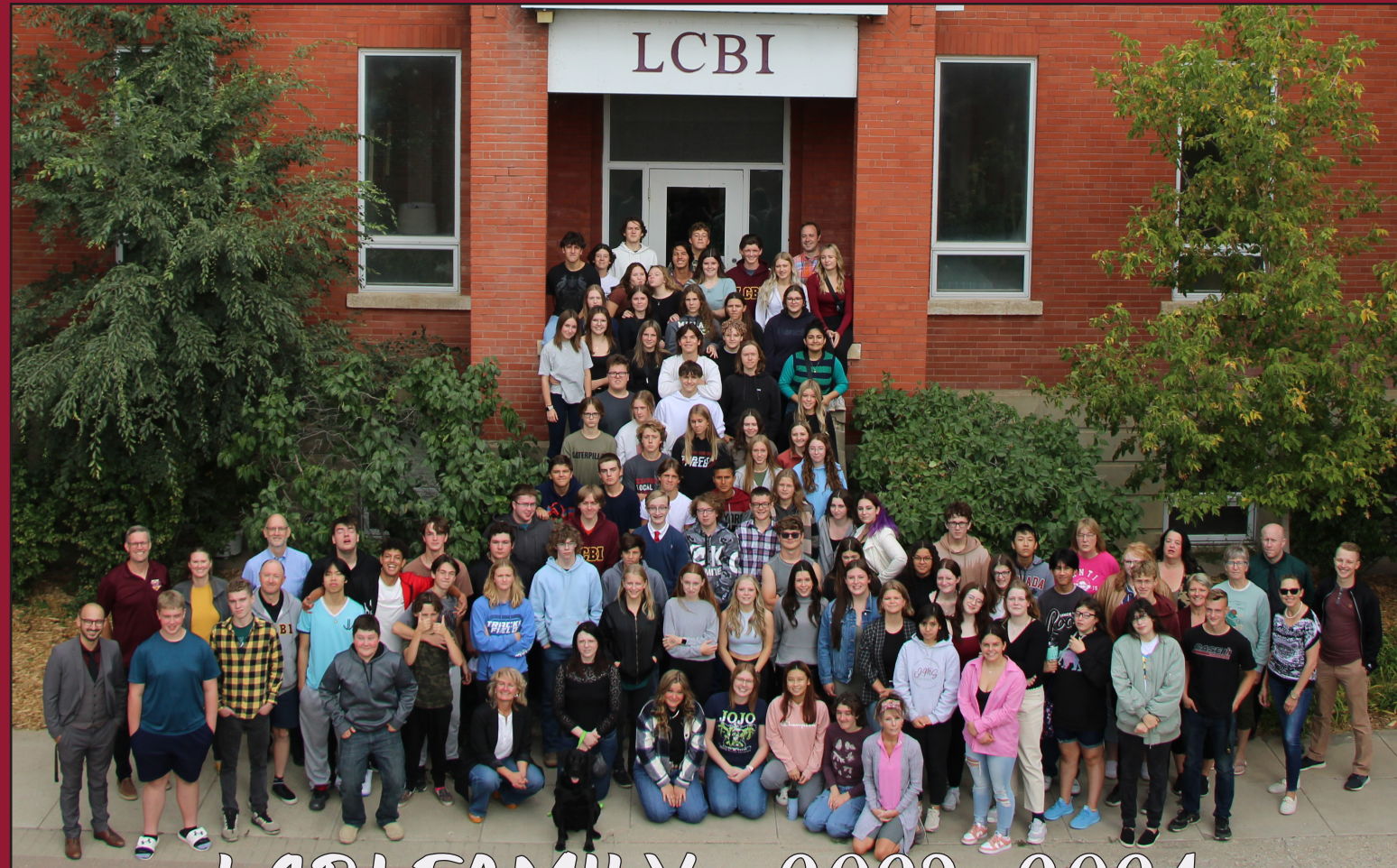
LCBI FAMILY • 2023-2024