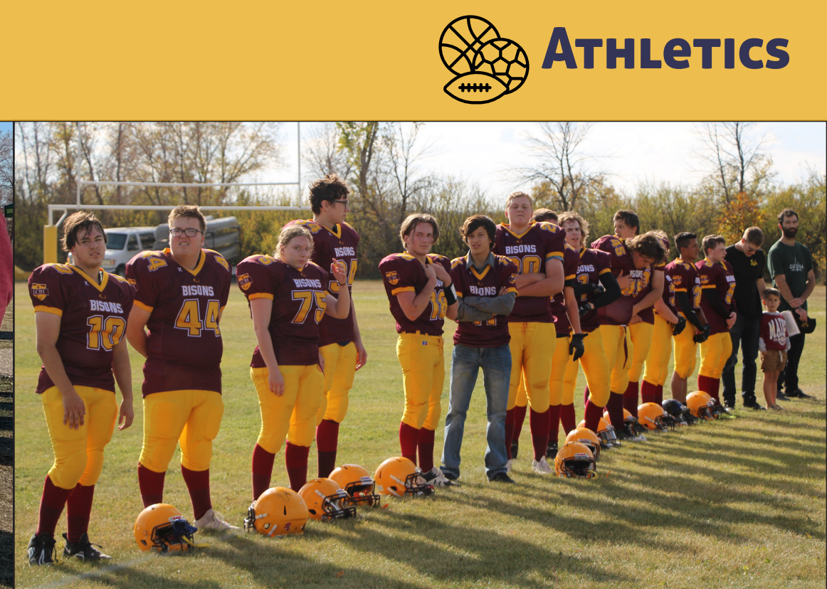
Bison Football Home Opener, September 2023