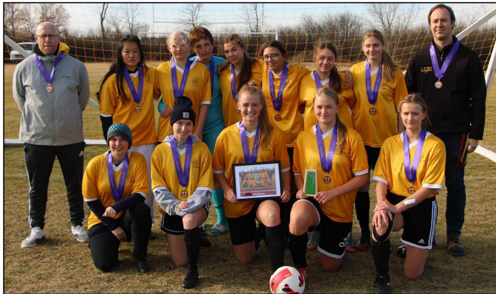
The Lady Bison soccer team won the provincial Bronze medal in October and was also presented with the Sportsmanship Award, in recognition of their great attitude and strong fan support.

Godspell, had four performances and wrapped up with a wonderful Sunday afternoon matinee.