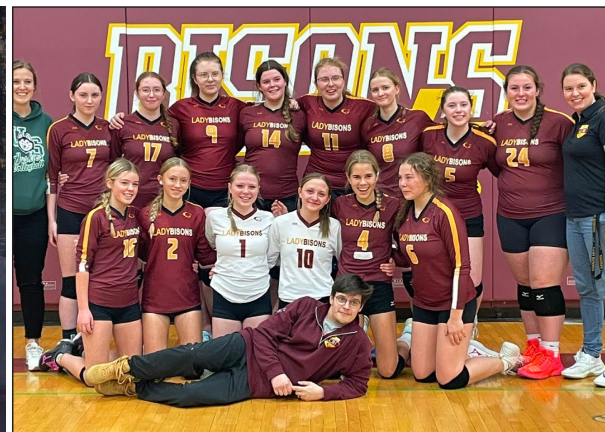
Senior Varsity Girls Volleyball Team, after hosting the 2A Conference