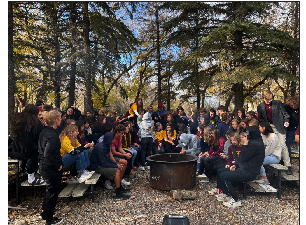
Above: On Fridays the students lead Chapel in their House Groups. The Luke house hosted an outdoor Chapel including worship and fellowship around the fire, October 2023