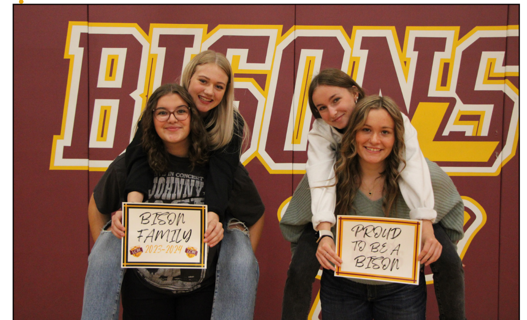
Grade twelve students enjoying their last "first" day of school.

The music program continues to grow also, with advanced musicals and longer house plays each year. Our June musical,