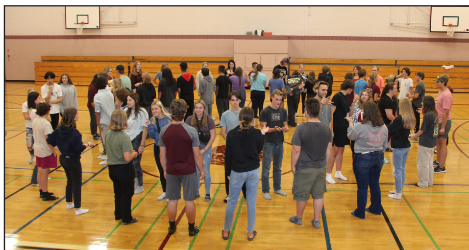
Opening Day of school features many “get to know you” games. In early September, our students did some “Speed Friending,” which involves asking rapid-fire questions for thirty seconds so we can get to get to know as many people as possible.

At LCBI, we continue to hold ourselves to the highest standards, and our dedicated staff go above and beyond to deliver engaging lessons that foster critical thinking, creativity, and a love for learning.