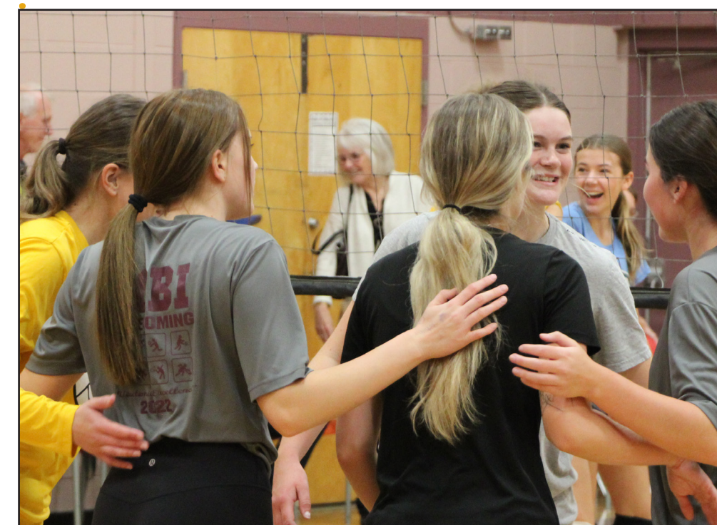
The new volleyball nets were very much appreciated during many games at Homecoming, 14 October 2023

There are many projects that we would like to undertake in this coming year,