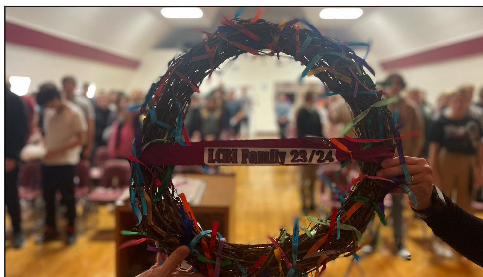
This year's Family Wreath, our tradition in which all students and staff write their names on a ribbon and tie it to the wreath.

As the new school year unfolds, I am very thankful to have the opportunity to work with another wonderful group of students and staff here at LCBI. I pray that potential students will continue to answer the call to join the family of LCBI. I would also like to take this time to thank our alumni and community for their continued support and prayers.